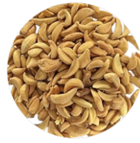
Dehydrated Garlic Flakes