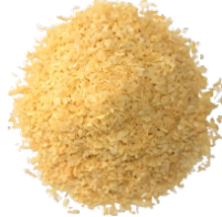
Dehydrated Onion Minced Toasted