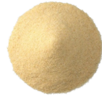
Dehydrated Onion Powder