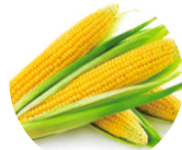
Yellow Maize/ Corn