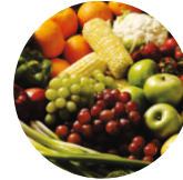
Mix Fruit & Vegetable