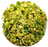
Dehydrated Cabbage Flakes