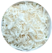
Dehydrated White Onion Flakes