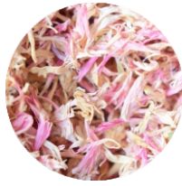
Dehydrated Pink Onion Flakes