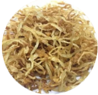
Fried Onion Flakes